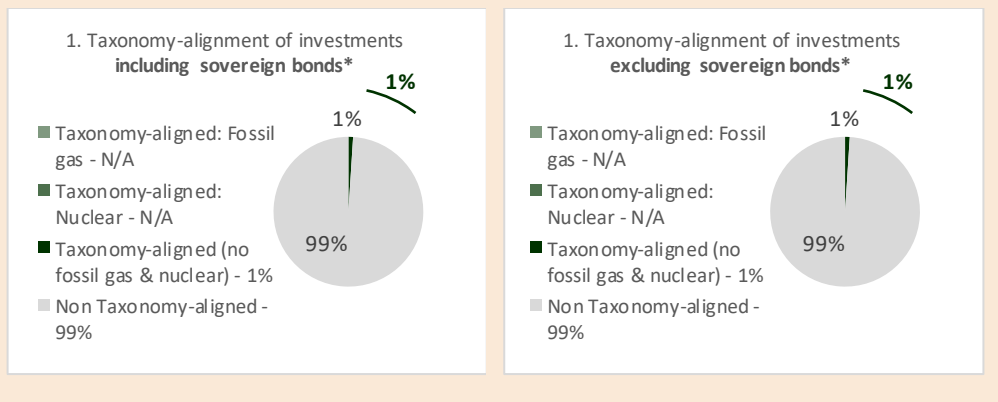
* For the purpose of these graphs, 'sovereign bonds' consist of all sovereign exposures.

The two graphs below show in green the minimum percentage of investments that are aligned with the EU Taxonomy. As there is no appropriate methodology to determine the Taxonomy-alignment of sovereign bonds<sup>*</sup>, the first graph shows the Taxonomy alignment in relation to all the investments of the financial product including sovereign bonds, while the second graph shows the Taxonomy alignment only in relation to the investments of the financial product other than sovereign bonds.